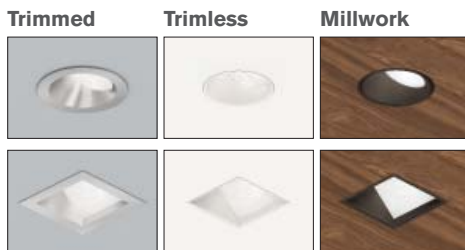
Universal and Field Convertible - Trim | Trimless | Millwork